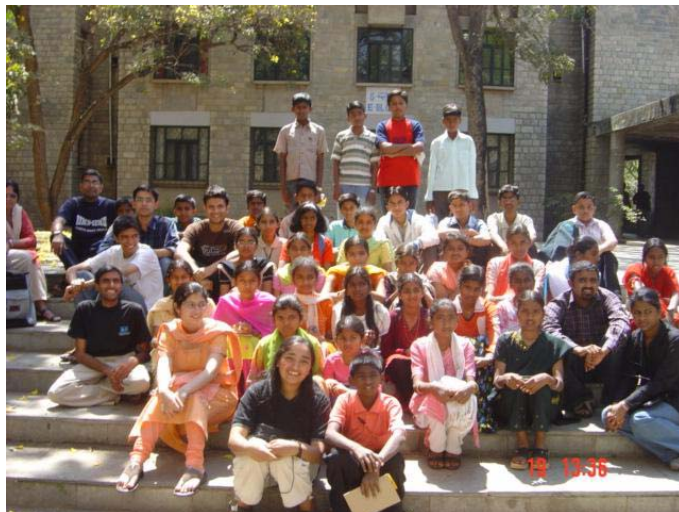
(Photo taken at IIMB on the occasion of Pragati scholars' visit in 2005)

Vikasana , a developmental effort by the students of Indian Institute of Management, Bangalore has joined hands with Pragati. Vikasana contributes financially as well as by way of providing Pragati scholars extra-curricular input.