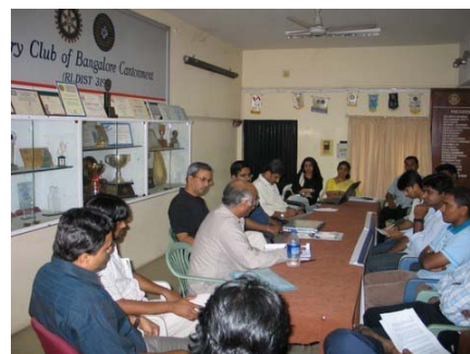
(Mentors meetings in progress)