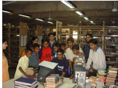
(Pragati scholars' visit to the IIMB campus)

SAFE , a social development initiative of Tata Elxsi Limited works with Pragati in meeting its objectives. In addition to generous financial support, a team of highly dedicated SAFE volunteers helps Pragati in its various educational support activities.