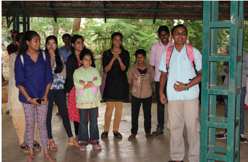
Scholars having fun

Education brings awareness, transformation and ultimately helps one to progress in life.