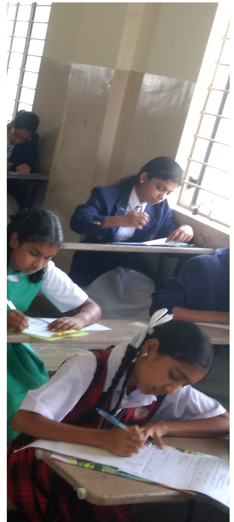
Students concentrating during the written test

We are fortunate to have generous patrons and well wishers who are the bedrock of Pragati's progress