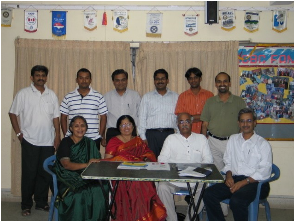
Pragati Team 2007-A blast from the past