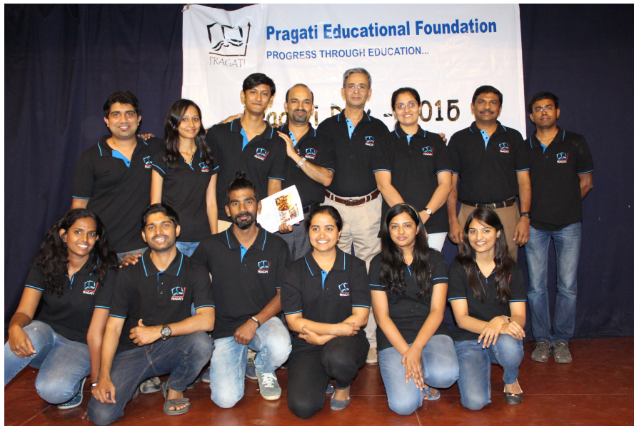
Pragati Team- All the mentors along with the trustees

I was one of the Pragati scholars a few years back, I did my engineering in a reputed college and I enjoy my work in my field. I felt it was high time to give back to the society in my own unique way and what better way than to go back to my roots.