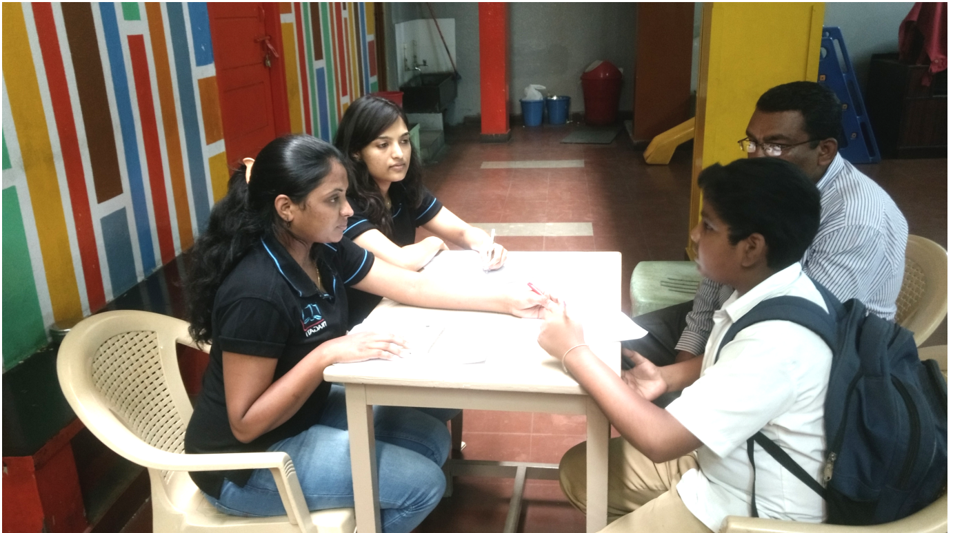
Mentors are trying to understand the student's financial and academic needs

Admins of Modern Public School were kind enough to let us conduct the test at their school. All the mentors assembled at 8:00 AM. It was as much a test for the mentors as for the students. Mentors had to give their best to understand the student's financial need, academic performance and passion in academics and other phases of life to select deserving students.