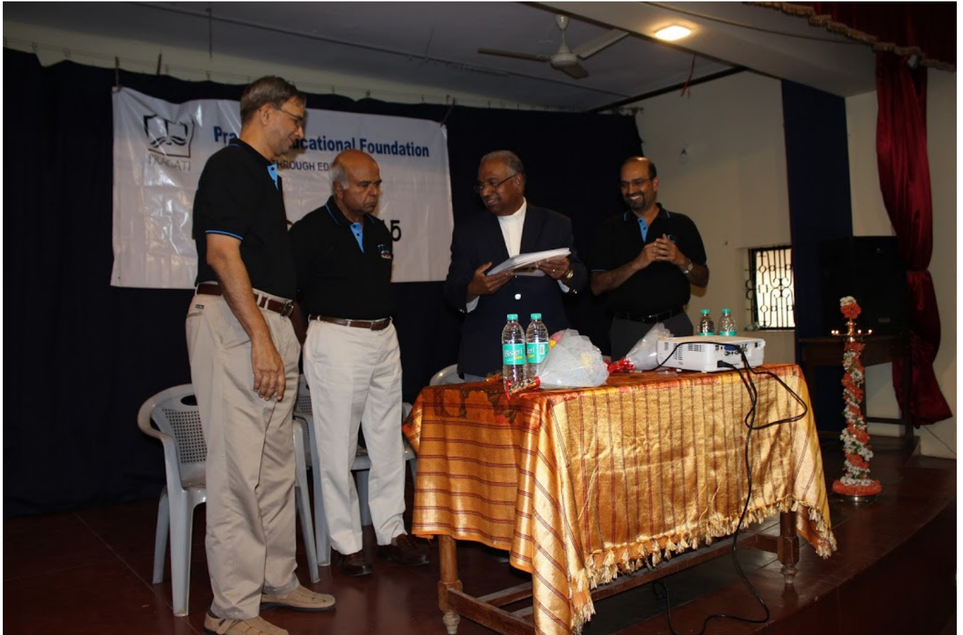
Pragati Annual Day- 2016

The day started in a rush for the mentors as they arranged for the event. As the students and parents started coming, the atmosphere was brimming with energy.